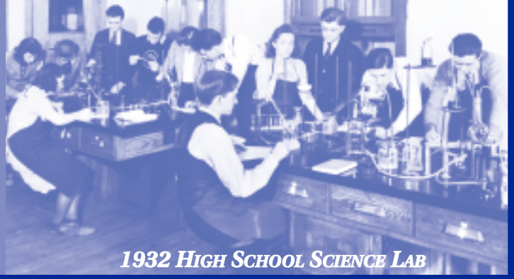
1932 HIGH SCHOOL SCIENCE LAB