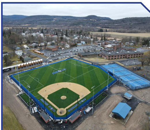
The district's new athletic field complex was part of Phase 1 of the capital project approved by voters two years ago.

The Schoharie EPTSO is an organization that provides funding for field trips, extracurricular activities, staff appreciation, some school assemblies, and more. It is an all volunteer-run organization, and they are always in need of more people. Please consider becoming a member of the EPTSO. There are roles big and small for caregivers, Schoharie staff, and students. Every individual counts and all of their efforts go toward activities and support for Schoharie Elementary.